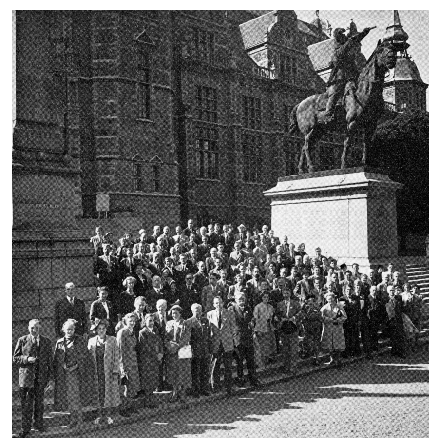
Some of the roughly 230 delegates to the 1951 congress, gathered in front of Nordiska Museet.

Apparently, Madriaga was the ideal formal and symbolic head of an international organization. He held a solid reputation as a diplomat, pacifist, scholar, and author, and he spoke the main languages fluently. He had very